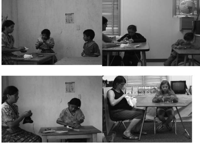
Figure 1. Scenarios for Sessions 1 and 2. Session 1. Mayan (top left) and European American (top right) children wait their turn and attend (or not) to the Toy Lady and their sibling constructing the mouse toy. Session 2. Mayan (bottom left) and European American (bottom right) children attempt to construct a frog by themselves, while the Toy Lady is busy with her work.

the nonaddressed children would do naturally as they waited, so she should neither encourage them to do anything nor inhibit them from doing anything.